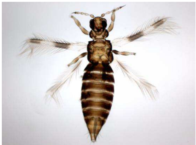
Figure 2: Larva I and female in microscopic slide