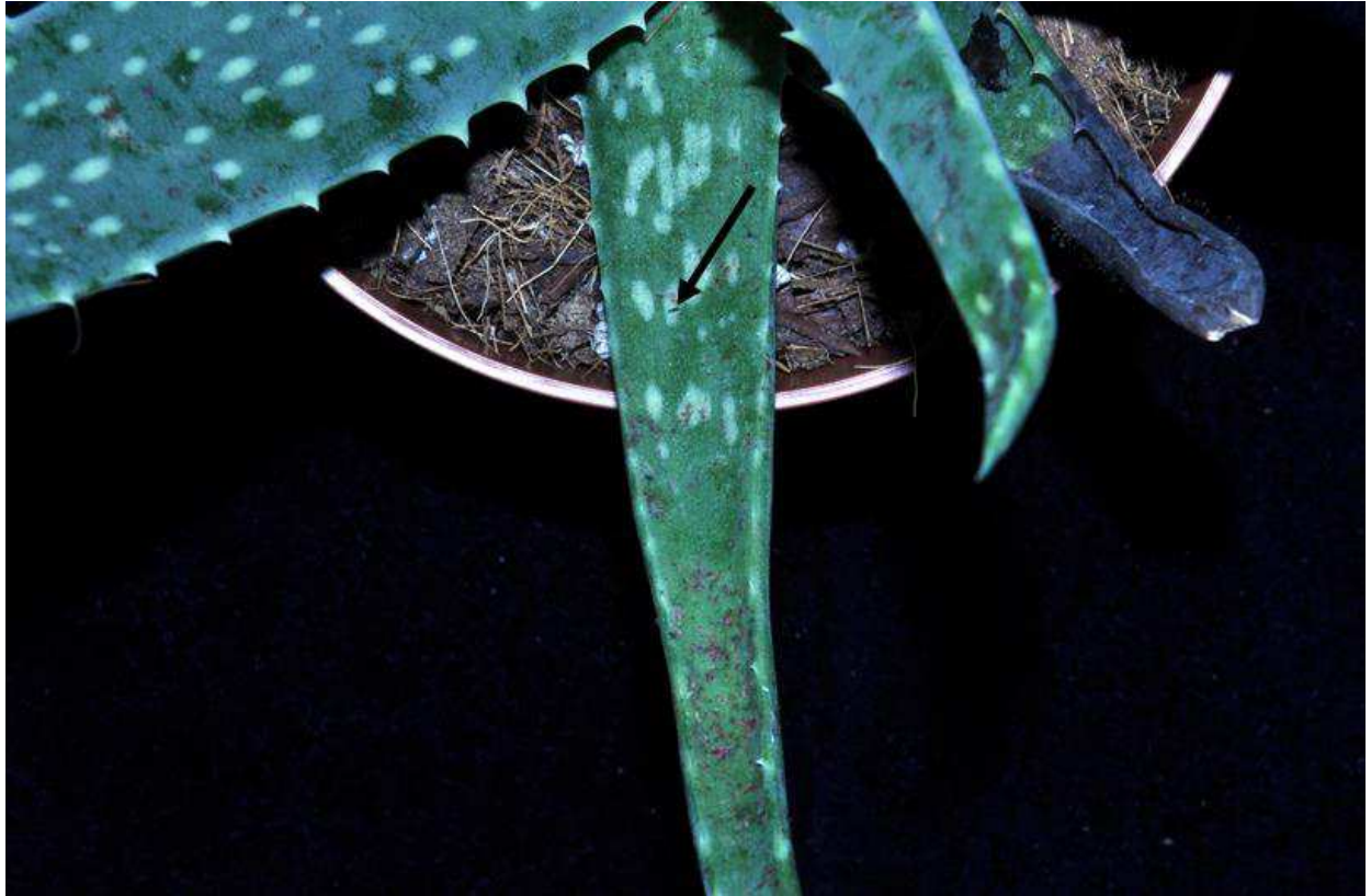
Figure 1: Part of small Aloe vera plant with female (arrow) and feeding damage