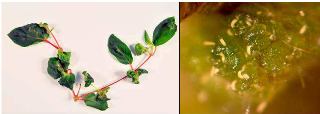
Photo 1 - Galls on Fuchsia (left), gall with specimens of Aculops fuchsiae (right).

The shape of the galls and morphological characters of about 0.2 mm long adult mites have led to a final diagnosis. The original description of the mite (Keifer H.H., 1972. Eriophyid studies C-6: 21, 22. Agricultural Research Service, US Department of Agriculture, USA.) was used for comparison of morphological characters with magnifications up to 1000x.