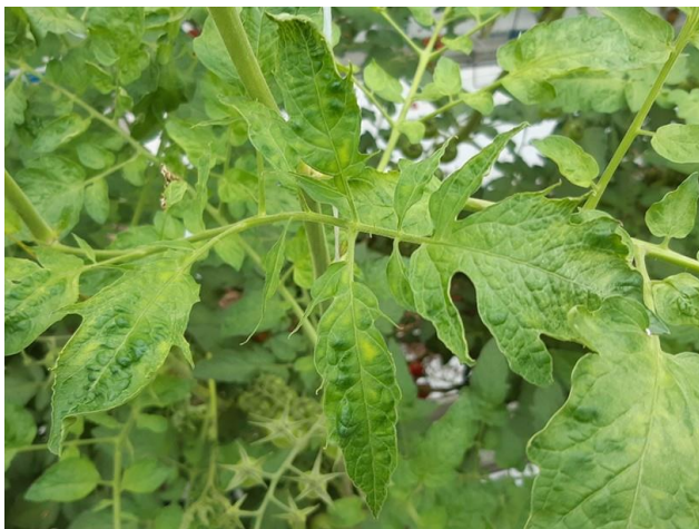
Figure 3: Narrowing of young leaves, typical symptoms of several tobamoviruses in tomato plants. (NPPO of the Netherlands, 20191007)