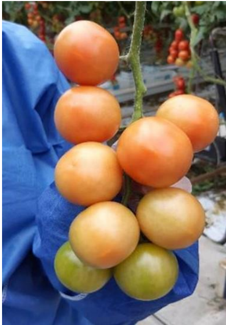
Figure 1: Some fruits of ToBRFV and PepMV-affected tomato plants showed a delay in ripening.