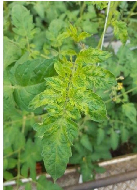
Figure 2: Mosaic symptoms in the young leaves of ToBRFV and PepMV-affected tomato plants (NPPO of the Netherlands, 20191007)